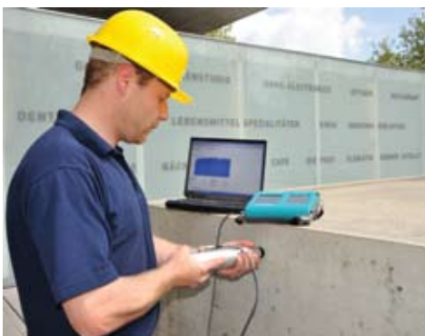
Control and data transmission to PC/Laptop