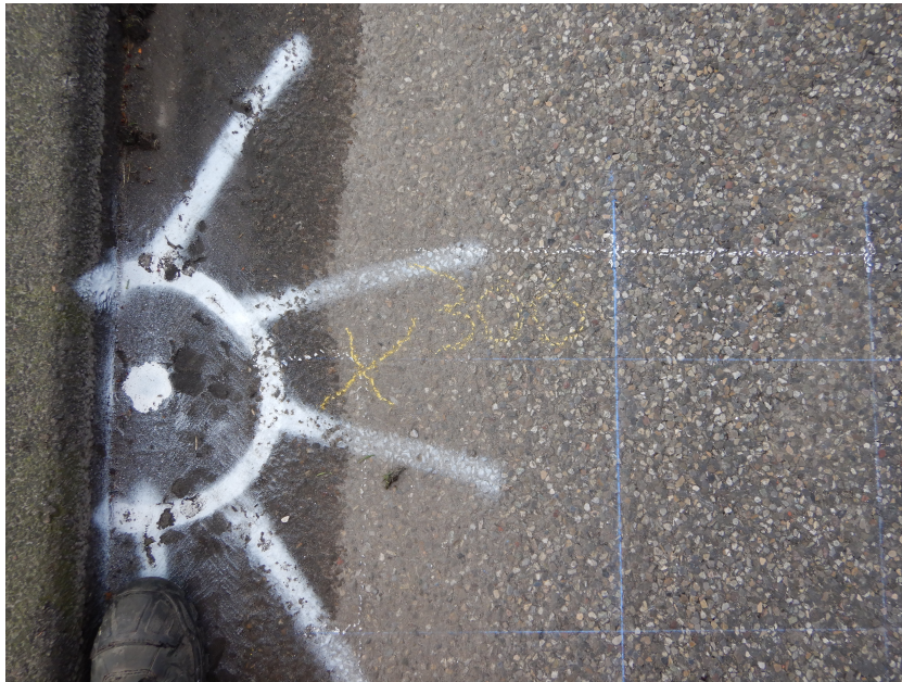
The indicated position for the light poles

The new indicated locations for the light poles, however, were either hard to reach and inspect, too close, or on the elevated sidewalk.