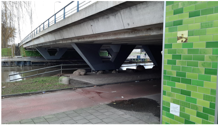
Side view of the bridge and drawings with indications of GPR data collection

The new indicated locations for the light poles, however, were either hard to reach and inspect, too close, or on the elevated sidewalk.