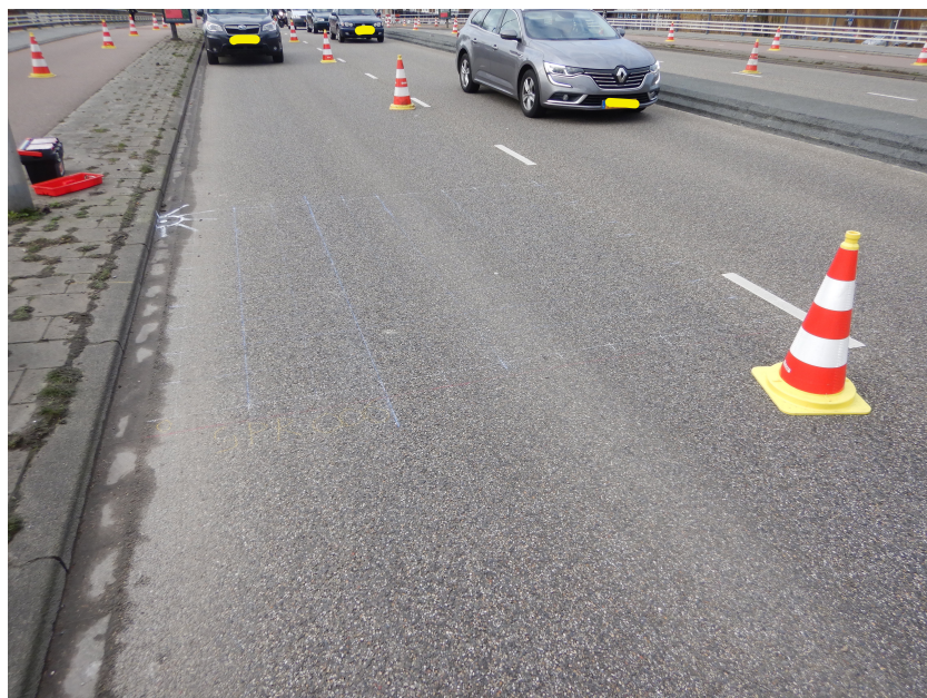
Traffic is a concern when working on bridges

The crucial part of an investigation over a bridge is the limited time you have to work on the site. Limiting the traffic or closing the bridge usually costs money to the bridge administrator and so GPR is a convenient method as it collects data fast, without causing any damage to the bridge.