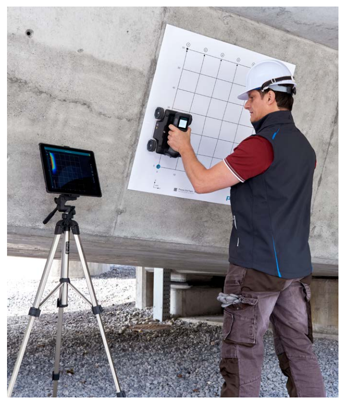
Proceq GPR Live performing an area scan with the aid of a Proceq grid paper