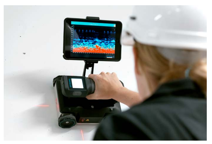
Proceq GPR Live combined with the device tablet holder

Proceq GPR Live is a groundbreaking product that offers a wide selection of accessories to fit every user's needs, such as the on-device tablet holder for single-hand operation and the telescopic rod for accessing hard-to-reach areas. Unlike other GPR products, its flexible set-up allows the user to always have a large screen at an optimal viewing position with all controls within easy reach.