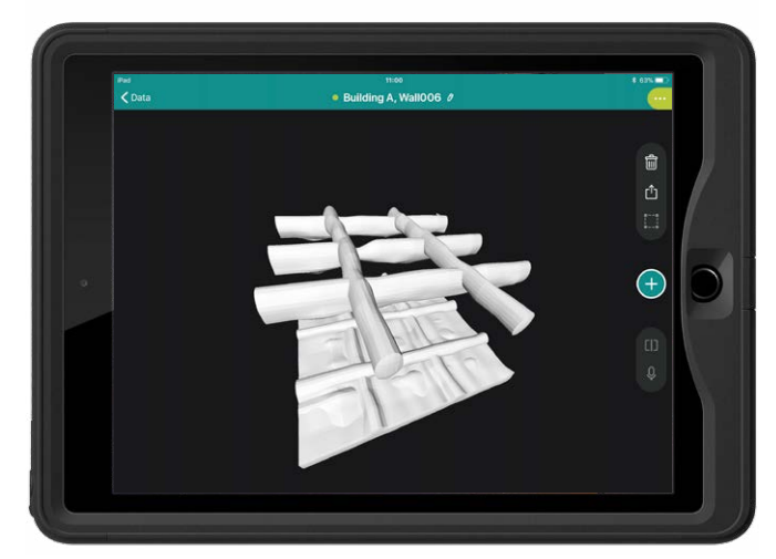
Procea GPR Live 3D view

Digital reporting, data sharing, and back-up are possible directly from the Proceq GPR Live app and through highly secure cloud services. The unique Logbook feature records the key parameters associated with every test including settings, time stamps, photos, site notes, and geolocation. Reports can be sent directly from the iPad on-site.