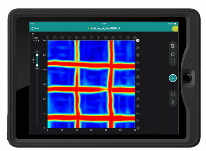
Proceq GPR Live time-slice view