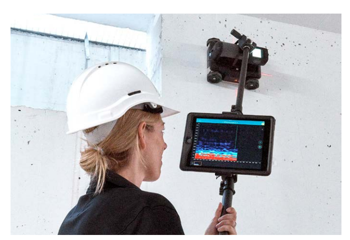
Proceq GPR Live combined with the telescopic rod with tablet holder

Proceq GPR Live is the beginning of a new era in NDT. The outstanding and unique ultra-wideband technology in structural building assessment combined with a compact wireless scan car delivers unmatched performance. The new Proceq GPR Live comes with the unique stepped-frequency continuous-wave (SFCW) technology delivering the widest frequency spectrum in the concrete assessment market. All applications typically addressed with multiple separate antennas in the range of 0.9 to 3.5 GHz can now be covered with a single device!